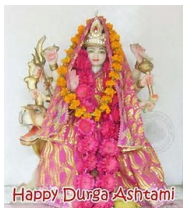
Happy Durga Ashtami