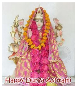
Happy Durga Ashtami