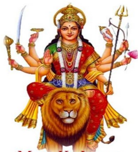
Mata Ka Jagran

Where: Berlin Temple, 25 E Taunton Avenue, Berlin NJ 08009